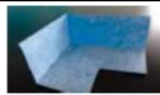
T corner I