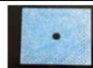
T wall collar